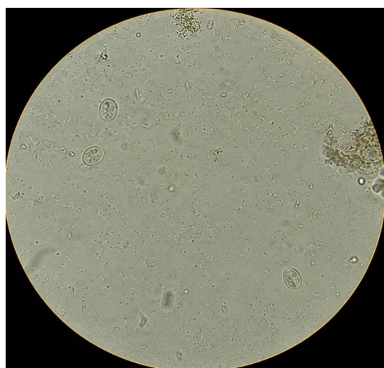
Image:1 Cryptosporidium oocysts (100X) Image:2 Giardia oocysts (40X)